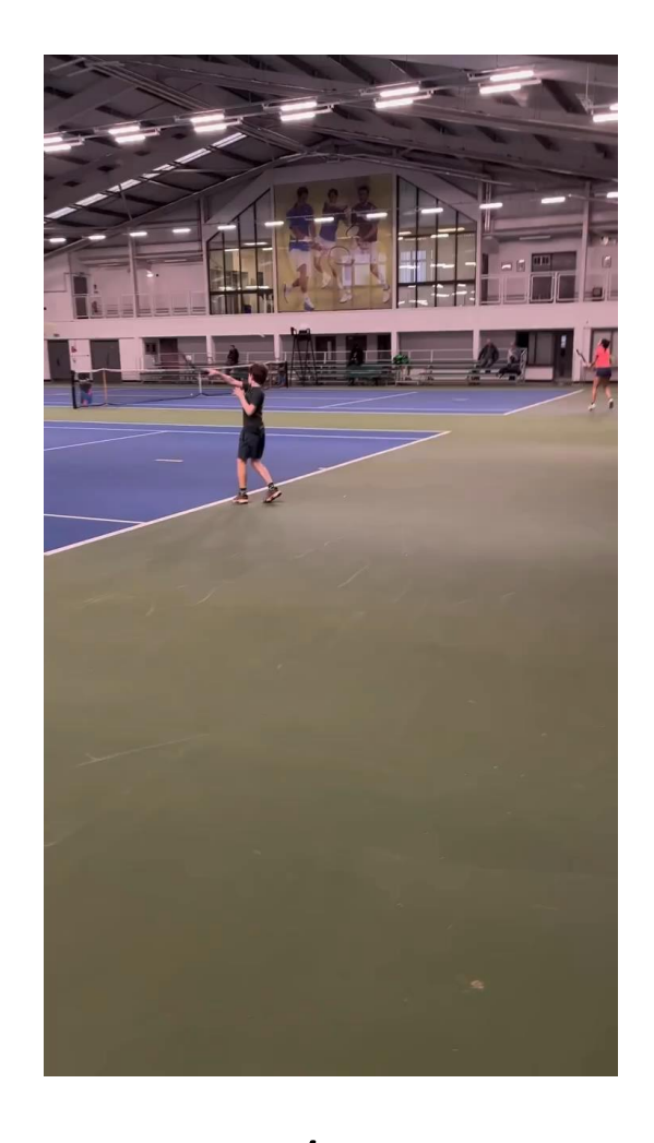
Dec 23/Jan 24